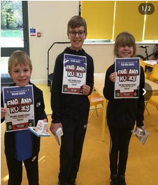
Today there have been many prizes given out for those children who participated in England Rocks (our Times Tables Rock Stars competition) this year! Congratulations to all of you, we are proud of your success!